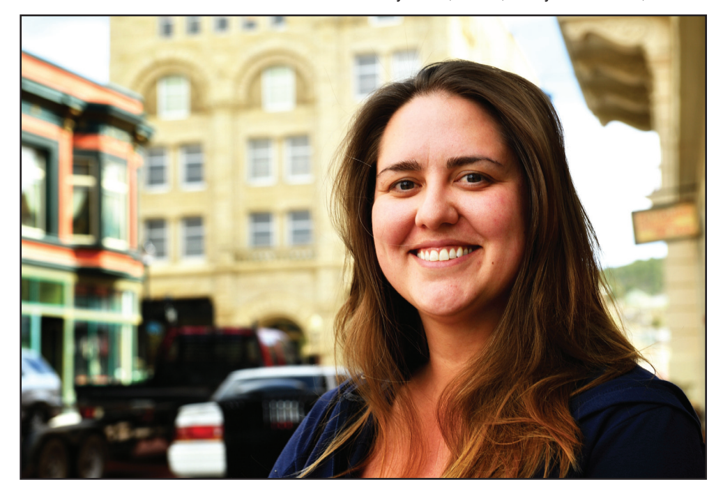
"I've been an art teacher for about nine years now. People don't understand or support education enough. It's the path to betterment for the individual, and for the individual to create the future that we can't foresee. Working one on one, you can see the potential in each student. We need to give students and educators the resources they need."