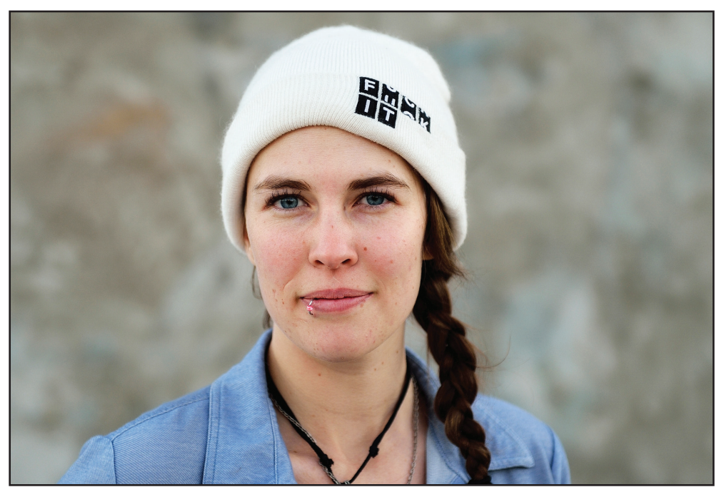
"Riding horses. I did three-day eventing for seven years. It's jumping, English. I started rodeo about five years ago and I was Chaffee County Rodeo Queen in 2013."