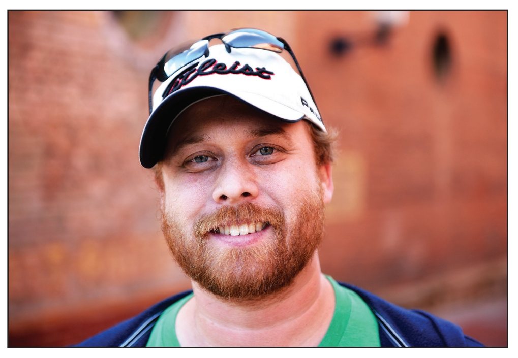
"I'd have to say my beanie is one of my favorites even though I left it at home. It's black and gray, North Face. I got it in Houston six months ago. I like a lot of my shirts but my pot shirts are my favorites."