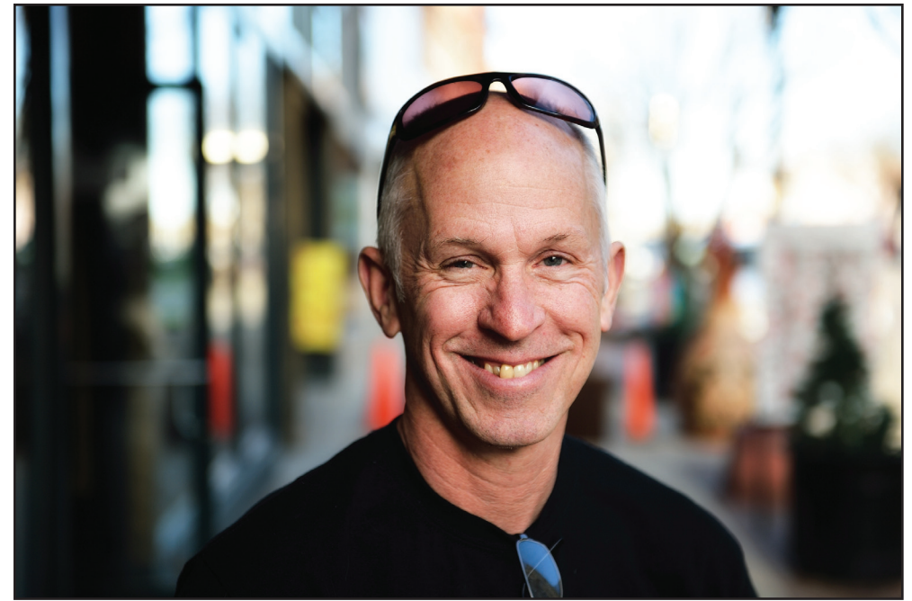
"Blue jeans. I try to get two days out of a pair, then I go to another pair. I own about 14 pairs of blue jeans with various degrees of holes in the knees."