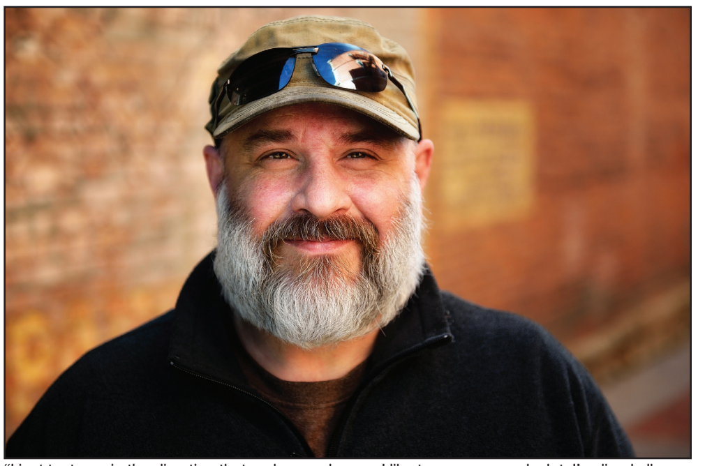
"I just try to go in the direction that makes me happy. I like to move around a lot. I've lived all over, meeting different people and seeing how they live. This is the smallest town I've moved to, though I seem to be moving in that direction. It's been real relaxed, a cool little town. The people have been super nice."