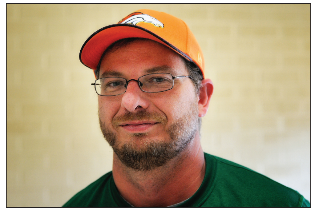
"The store I shop at most is Lowe's, the building supply store. We eat out most often at McCallister's Deli. I don't shop online much. For gas, it's all Loaf & Jug; in fact, that's probably more than everything else combined."