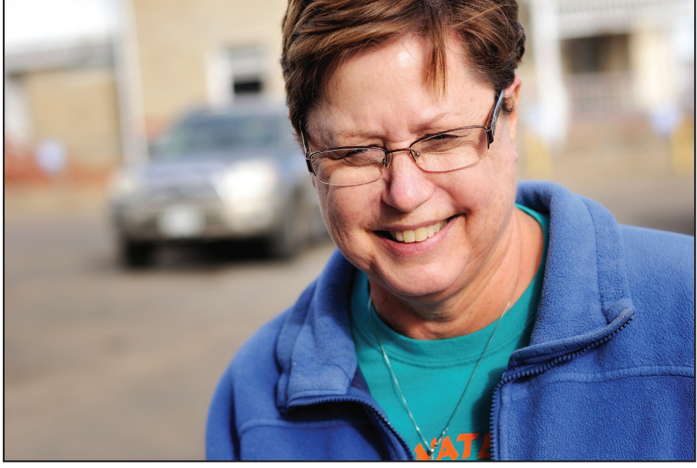
"I just use Amazon a lot. There's no tax or shipping charges and it's quick. Returns are easy. Customer service is great, unlike some places here in town. When I buy something here, it's probably Walmart, Safeway and Bealls. There's not a whole lot else, is there?"

"Safeway and Walmart. I don't drive. I take COG. If I can get everything I need there, I get it at Safeway. Otherwise I get a ride to Walmart. I don't do restaurants or haircuts. I don't have a computer. I order from catalogs—shoes, dresses, coffeemaker, vacuum cleaner, anything I need."