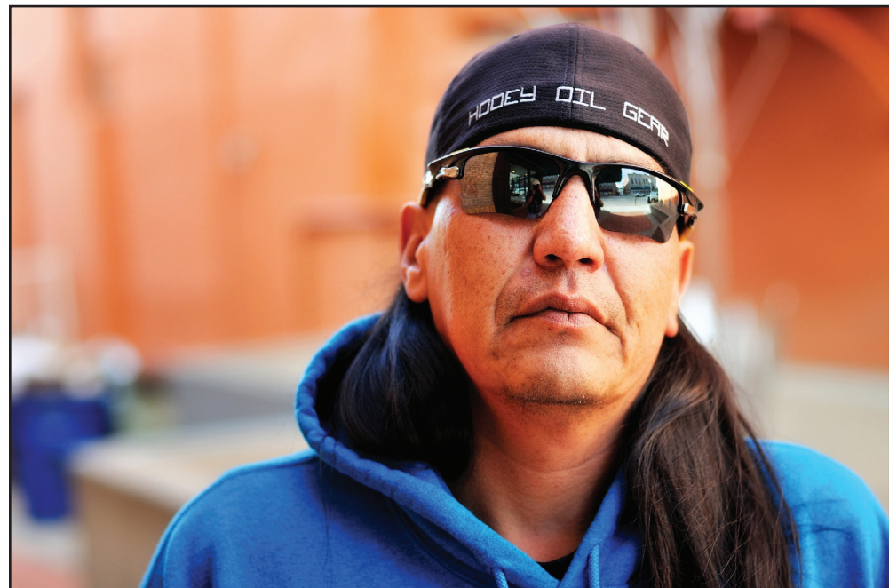
"In the mountains. I love the scenery here. I just moved here from Louisiana. I go hiking up in the mountains—Riley's Canyon, Long's Canyon, Monument, all around here. I like fishing and photography up there, too."