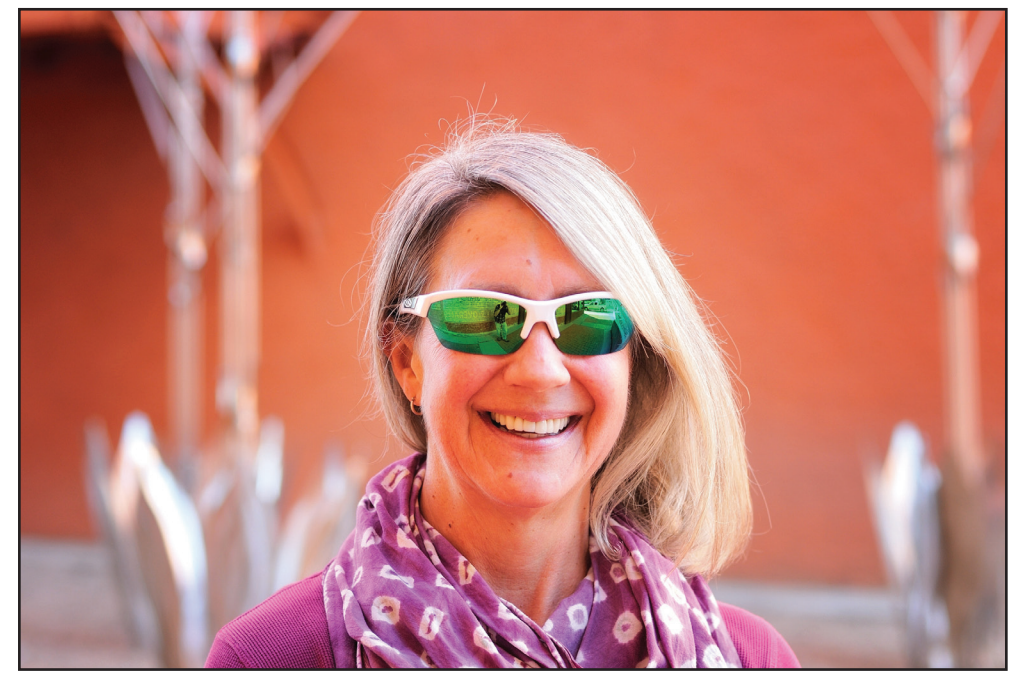
"Growing my own food. Eating good healthy food that I know where it comes from. Being 58 and fit and trim and healthy. How you take care of your body, it shows up."