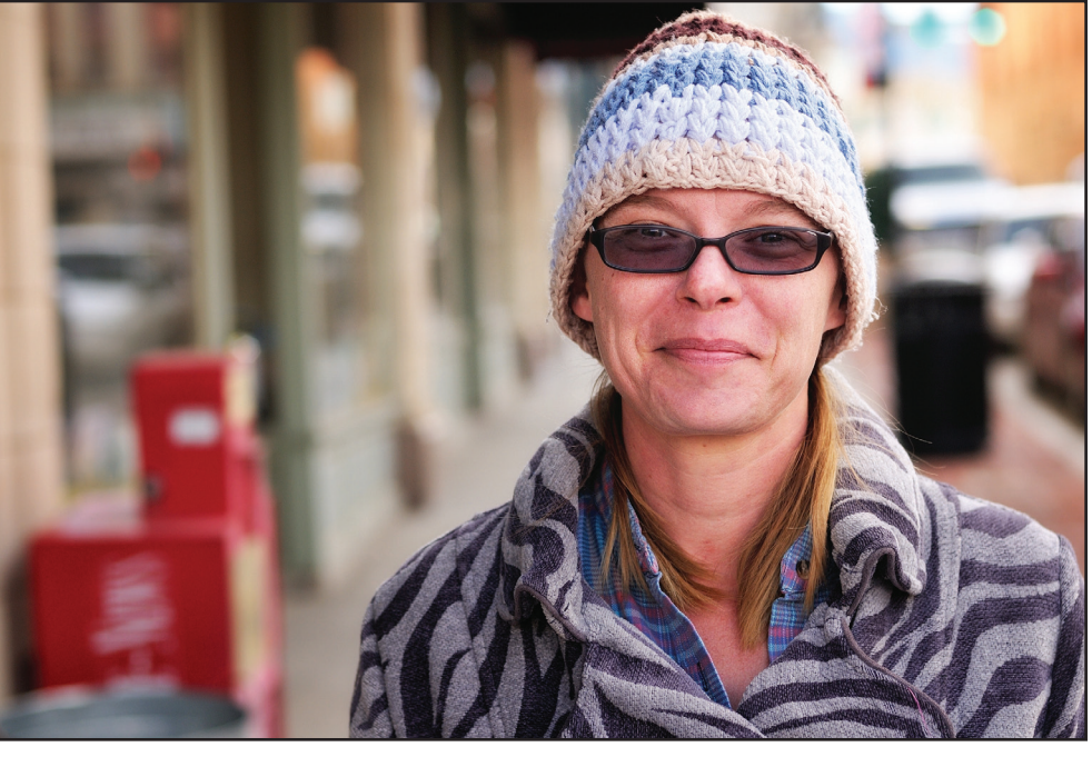
"When I wake up in the morning. When I have my first cup of coffee. When I look into his eyes. When we walk. That's one of the reasons I love this town: You can get everywhere by walking."