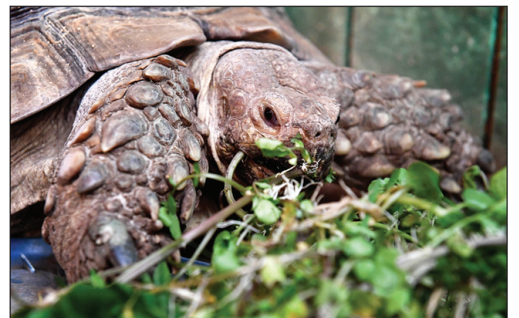
George is one of two huge turtles enjoying an easy life on the floor where visitors have to step around him at Colorado Gators. Almost 50 years old, George shares his meals with Durango, an African Sulcata Tortoise only 16 years old. Colorado Gators takes in rescued animals from throughout the U.S., with employees sometimes driving to the Denver airport to receive animals in shipping crates.