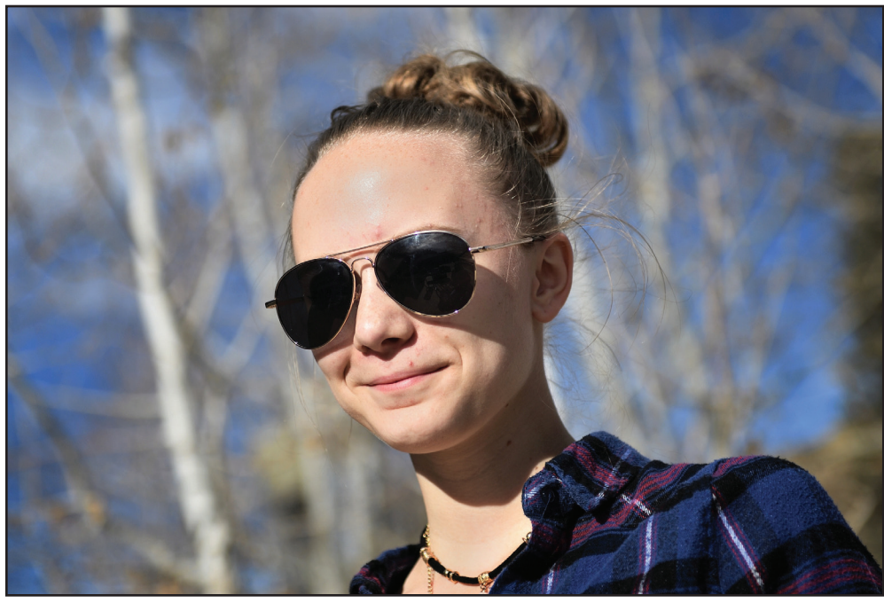
"Being around people that I love makes me happy. People who make me happy and inspire me—that makes me happy."