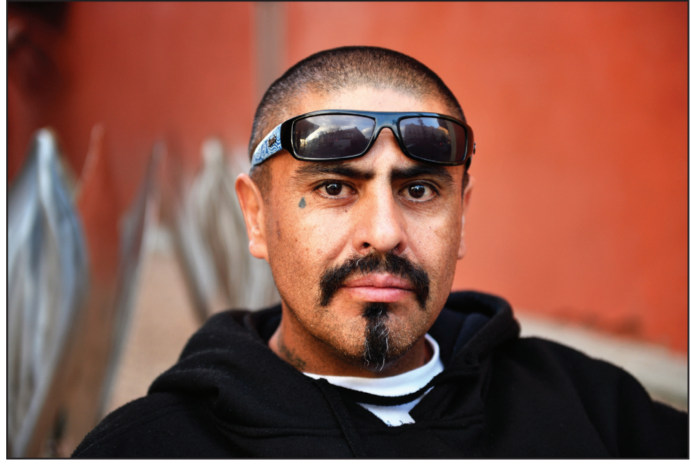
"I've never rode in an airplane. I've never had the chance. The farthest I've been was Marissa, Illinois, back when I was 17. I went in a car with a couple of friends. I've never ridden a train, either. I've been in a boat, fishing."