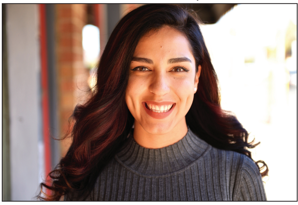
"I'm not used to driving downtown in El Paso. I turned the wrong way down a one-way street. Instead of turning around, I tried to make it to a parking lot ahead. A policeman pulled out and stopped me head-on. I thought he might think it was funny and let me go, but he wrote me a $200 ticket. It's the only ticket I've ever gotten."