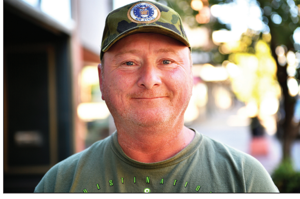
"I'm a cat person. We had dogs growing up but my wife turned me into a cat person. We have two. Boots used to come up to the house for food. When she had kittens under our neighbor's porch, my wife brought her in. We kept her and her daughter Patches. My wife died three months ago but I still have Boots and Patches."