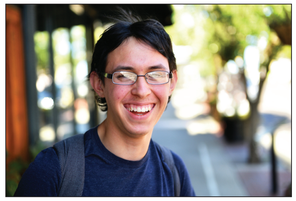
"I like the approach of winter. It's beautiful and it feels good. It's nostalgic, especially because of Thanksgiving and Christmas. I like to go outside and go sledding or make a snowman.