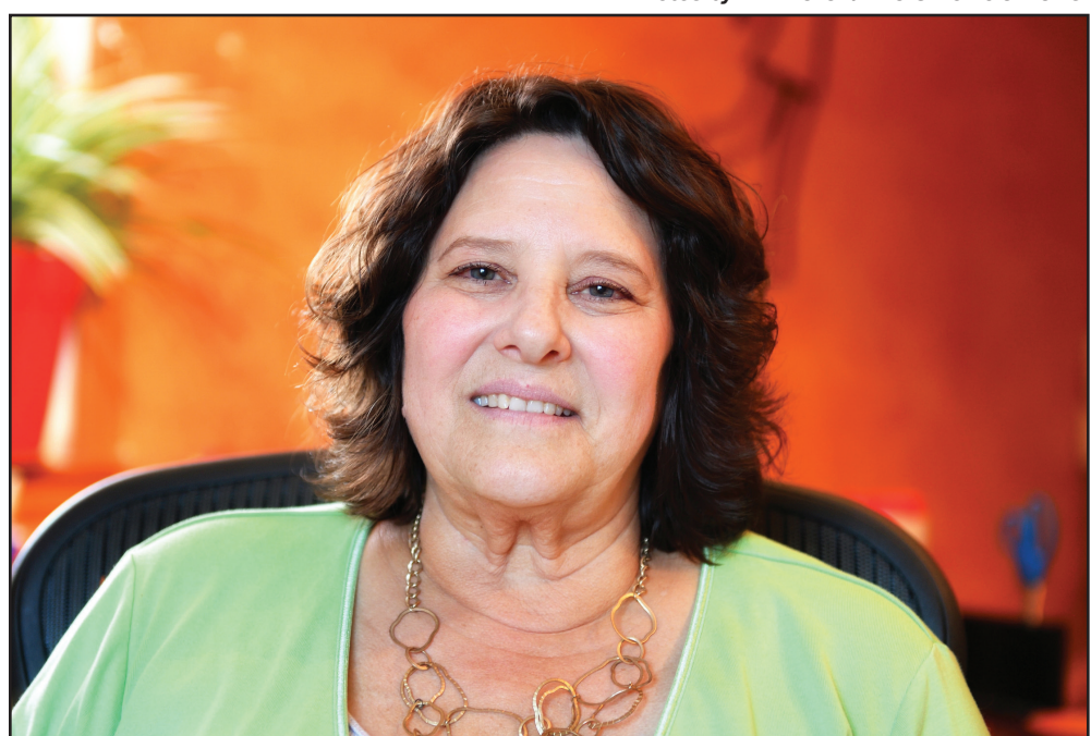
"Learn to appreciate who you are and value your talents because those things will follow you the rest of your life. If you love science, pursue it. If you're an artist, go for it. If your talents point elsewhere, they're unique to you so embrace them