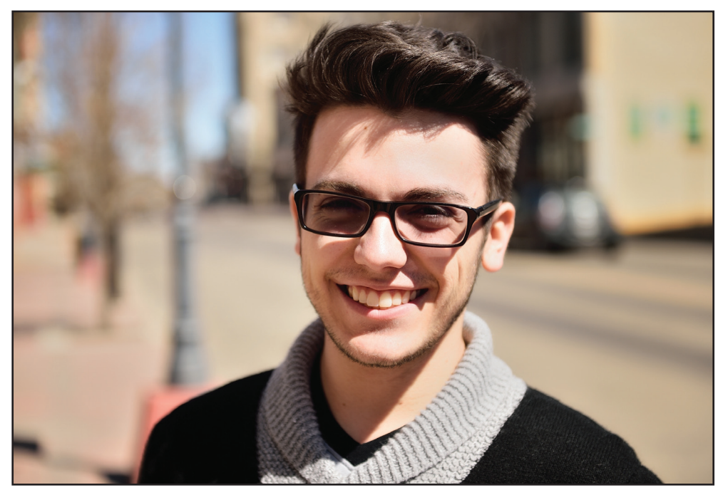
"Knowing and loving myself, my characteristics and talents, and figuring out who I am. RuPaul said 'Know thyself.' That inspired me, to find and know myself.'