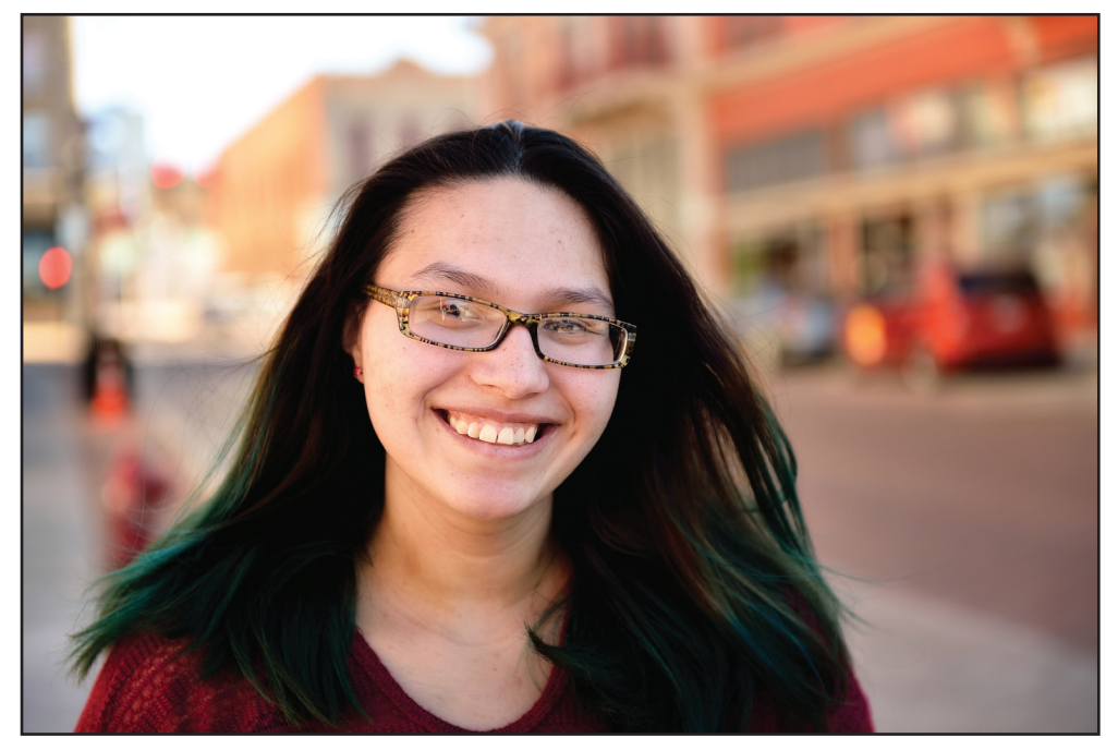
"The police officer dying the other day, from whatever happened to him. It was really close to our house. You never know what's going to happen to you."