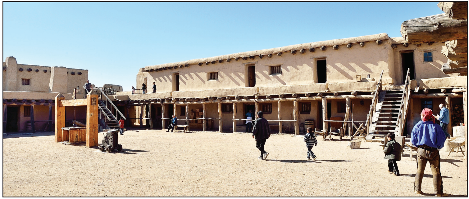
From 1833 to 1849, the population of Bent's Fort often reached from 150 to 200 people—trappers, traders, craftsmen, laborers, soldiers, herders, health-seekers and others. Employees numbered 60 to 100. The courtyard typically bustled with activity. In its center was a press that baled buffalo robes for transport and sale back east. Each year, as many as 15,000 robes were carried by wagon to the St. Louis markets. The elimination of buffalo contributed to the fort's demise.