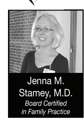
Seeing new patients ages newborn to senior Appointments can be made by calling