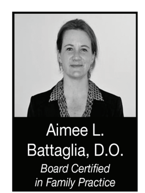
Seeing new patients ages newborn to senior Appointments can be made by calling