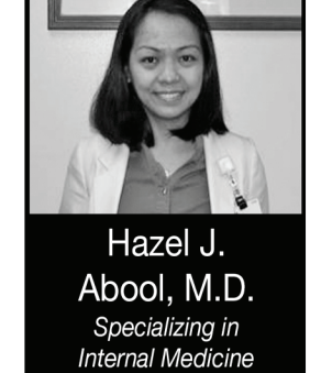
Seeing new patients ages 18+ Appointments can be made by calling

1100 Carson Ave. • Suite 203 Clinical Annex • La Junta, CO