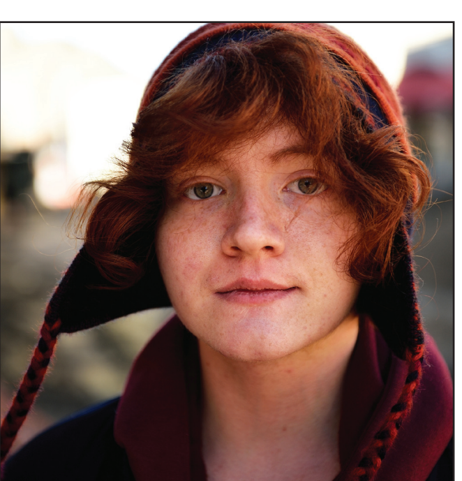
"My middle name is Winter. Winter is a time to focus on home and inner self. You're preparing to go into a new year so you're building your foundation for renewal. It's an introspective time."