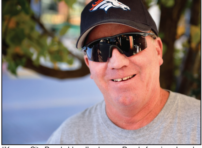
"Kansas City Royals blue. I've been a Royals fan since I graduated from high school in 1980. One of the kids in my class went to play pro ball for the Royals. I've been a fan ever since."