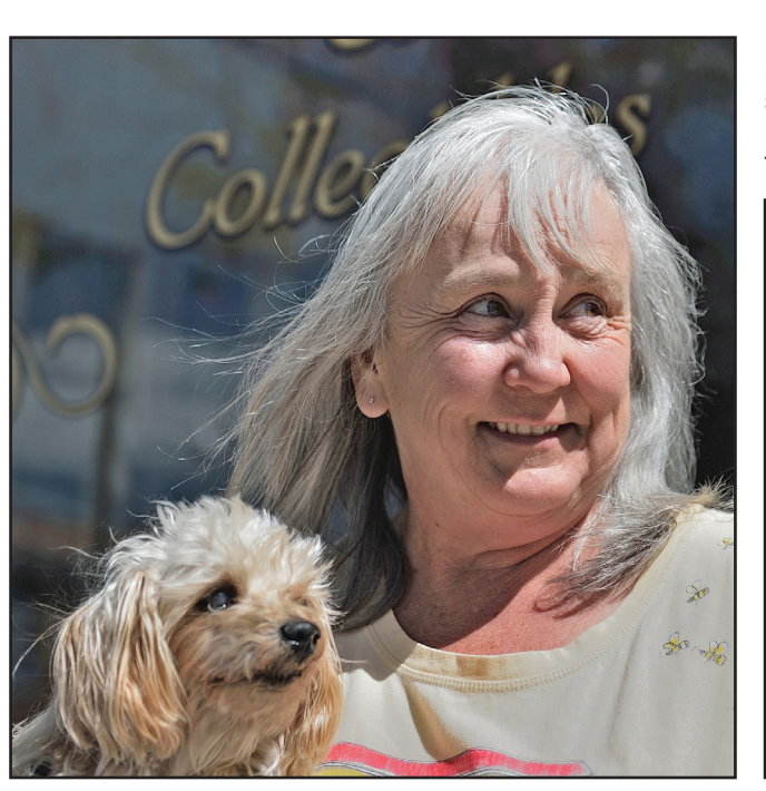
"We live up the river and work here in Trinidad. I live here for the slower way of life and clean air. It's better than the cities. We moved here from Denver in 1999.