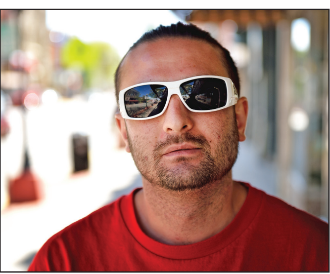
"I was born here. Except for a few months, I've been in Trinidad all my life. I like the landscape, the mountains, animals, changes in weather, the history and the people."