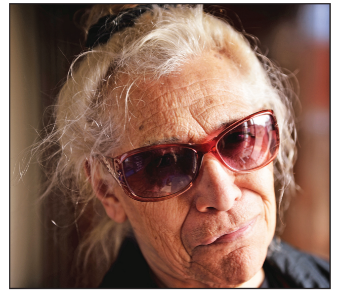
"I left Trinidad for about six years. I went to California to take care of my father's funeral arrangements and ended up working out there in aerospace. My children's illnesses brought me home to Trinidad"