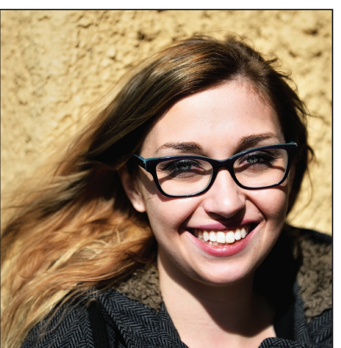
"Counting Texas as my home, the farthest has been Hawaii when I was six or seven. In the last five years, the farthest I've been is here. I'm traveling now just to see everything while I'm