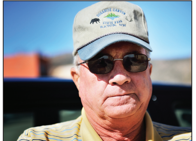
"Astoria, Oregon. My son lives there. It's right on the estuary where the Columbia River reaches the Pacific. The river is four miles wide there. We went last summer and we're driving out again in June.'