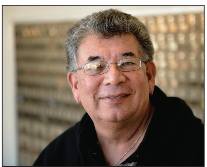
"Blackie, a black lab here in Raton. I was about six when we got him. He died when I was in high school. He was afraid of lightning and fireworks. He tore down the screen door one Fourth of July.