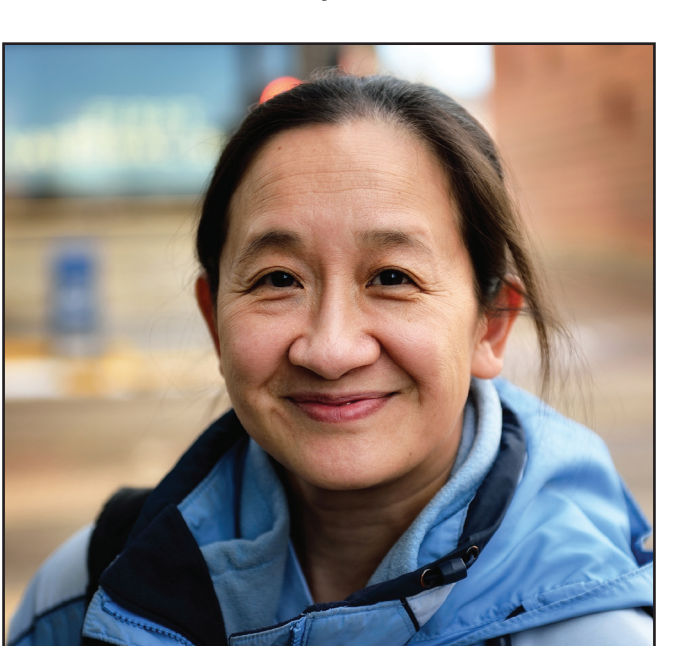
"Sam was my white miniature poodle from when I was 7 to 19. We got him from a family that couldn't keep a dog. He was a city