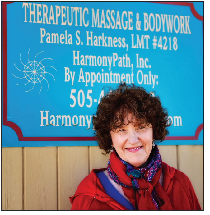
"Coconut cream pie. It was only for special occasions and always a treat. It was so pretty, and it had all the things we weren't supposed to eat, like sugar and whipped cream.