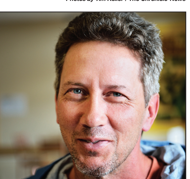
"Resourcefulness. Today my spoke broke and somebody had to help me. I'd like to get deeper in my resourcefulness, being able to fix anything on my bike without depending on anyone.