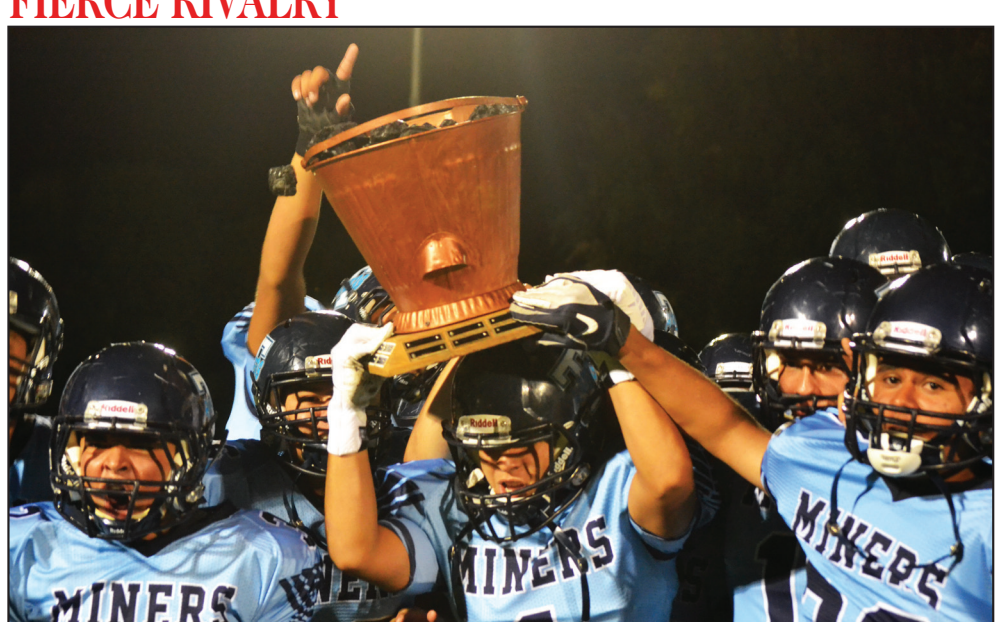
The Trinidad Miners football team celebrates their 47-0 victory over the Raton Tigers in the annual Coal Bucket Game Friday night at Miners Stadium. The Miners are 4-5 against the Tigers since the