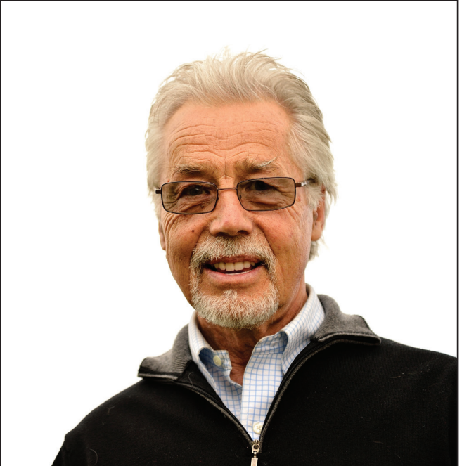
"I've been excited that Ristras is open and I've enjoyed the posole. I'm looking forward to trying the huevos rancheros for