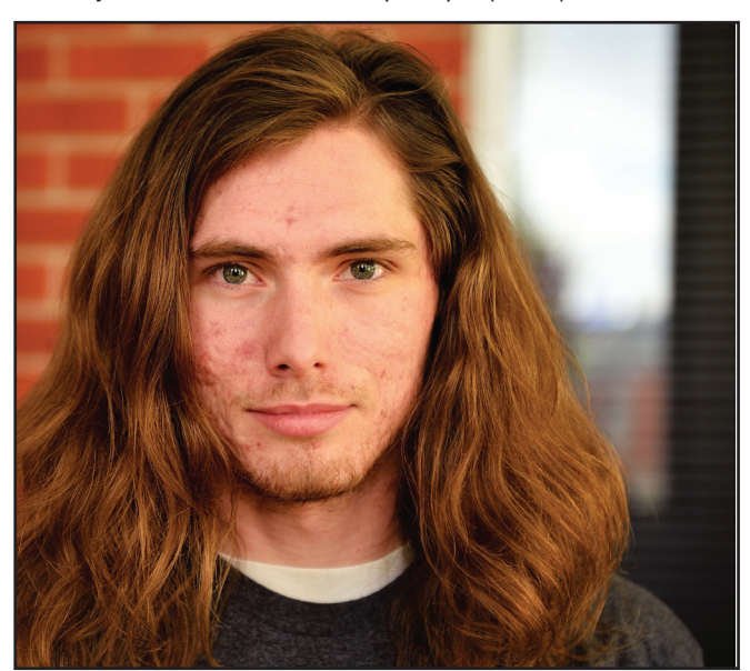
"Drive. People are content with being stagnant. They don't seek to better themselves and move forward. We also lack good leaders who inspire young people."