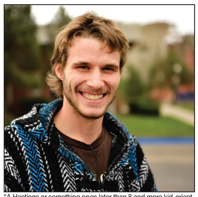
"A Hastings or something open later than 8 and more kid-oriented than 'old stores.' Hastings sells music, books, games, gags