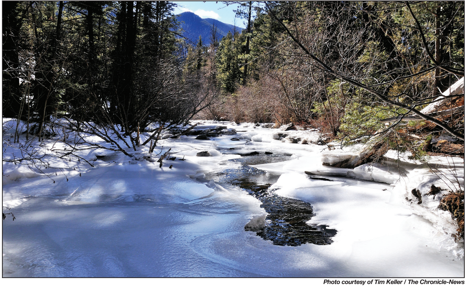
A frozen Cimarron River runs through Cimarron Canyon State Park west of Cimarron, New Mexico, and can be seen basking in the winter sunshine.