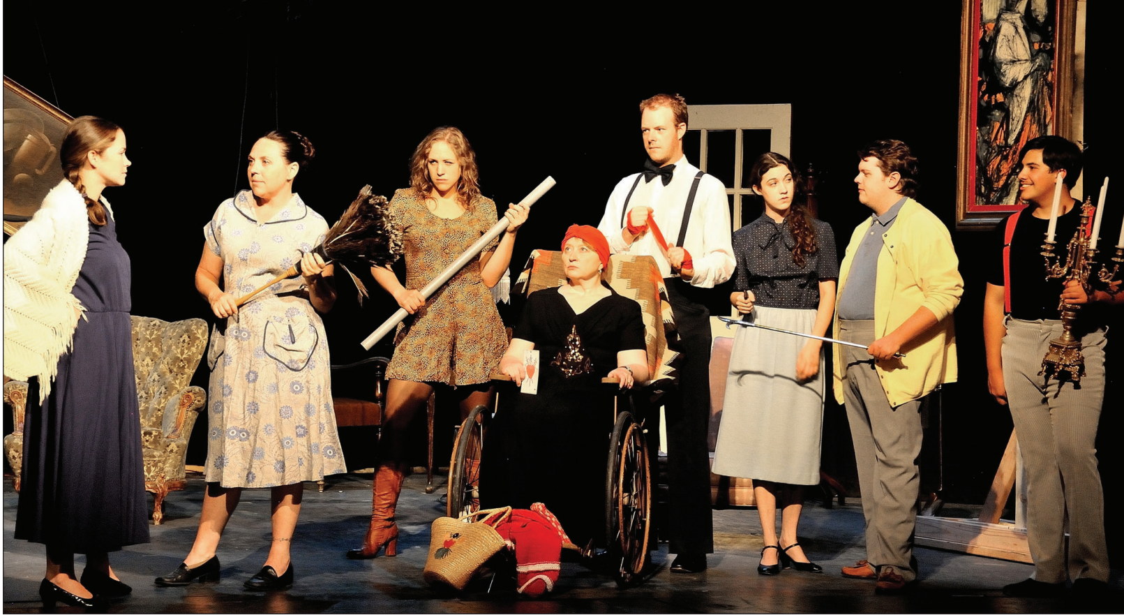
Tim Keller/Special to The Chronicle-News

Mendez began with the set design, an edgy and disjointed mansion interior in which walls are only suggested. Paintings hang suspended and off kilter. A door stands without a wall to hold