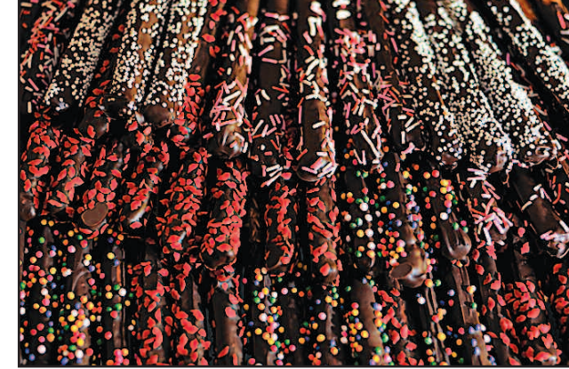
These photos represent a sampling of the delicacies that were available at the RHS Chocolate Factory on the evening of Valentine's Day.