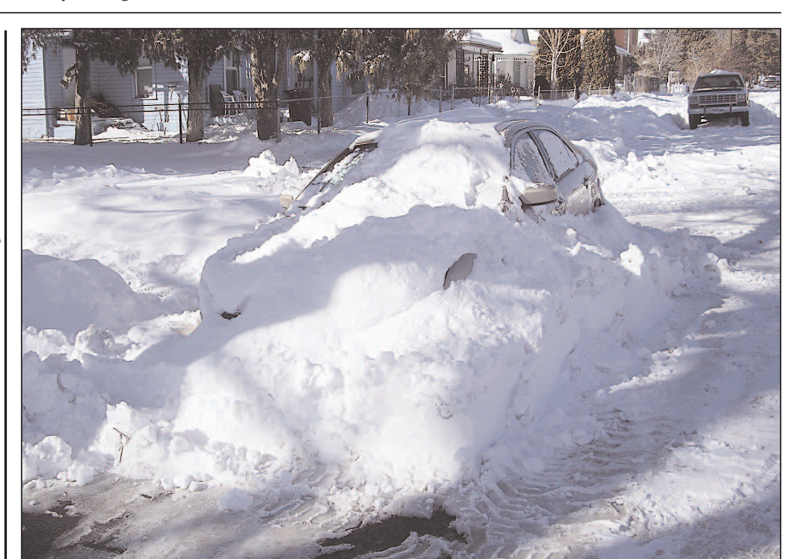
S'now way this car is going anywhere. The owner of this buried vehicle has some digging to do before getting out to slide around on Trinidad's streets.