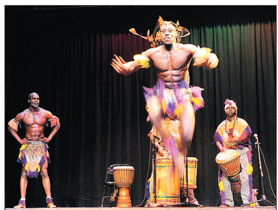
The dancers spent much of the show airborne.

dancers gave the answer, "No fast food."