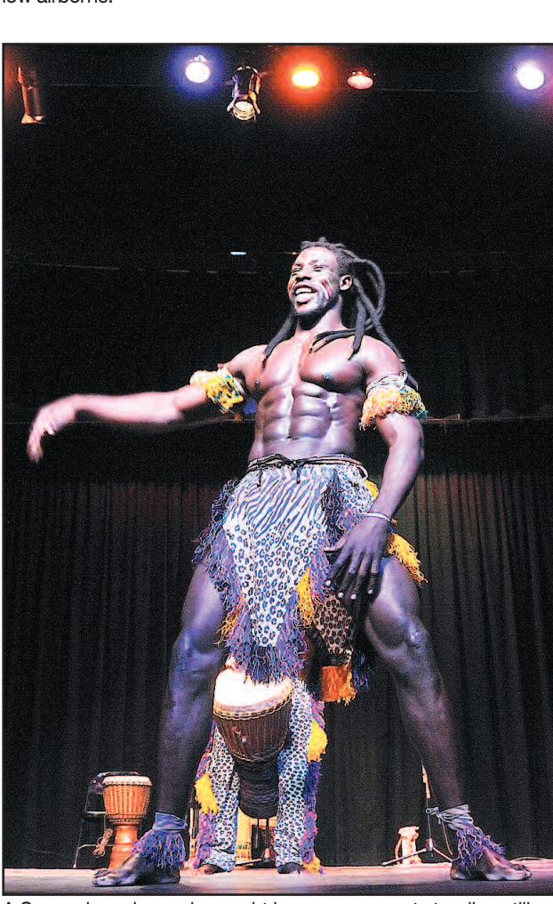
A Senegalese dancer is caught in a rare moment standing still.

should be. The Shortgrass Music Festival shared the wealth and booked the group into school assemblies Thursday at Maxwell and Springer, closer to the festival's Cimarron home. Then the four African men climbed into their oldermodel Toyota pickup with camper shell and headed north to the next show, leaving behind a string of New Mexicans thankful for getting an unexpected dose of African rhythm and