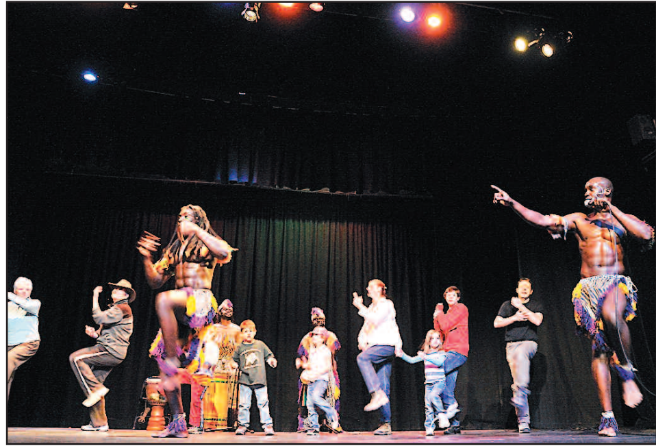
Nine Shuler Theater audience members were brave enough to take the stage and learn an African dance in front of dozens of people who were less bold.

find another situation. Near show's end, the dancers asked the audience whether they had any questions. Without missing a beat, a man from the center of the auditorium shouted, "What is African for six pack?" After a pause for thought, one of the