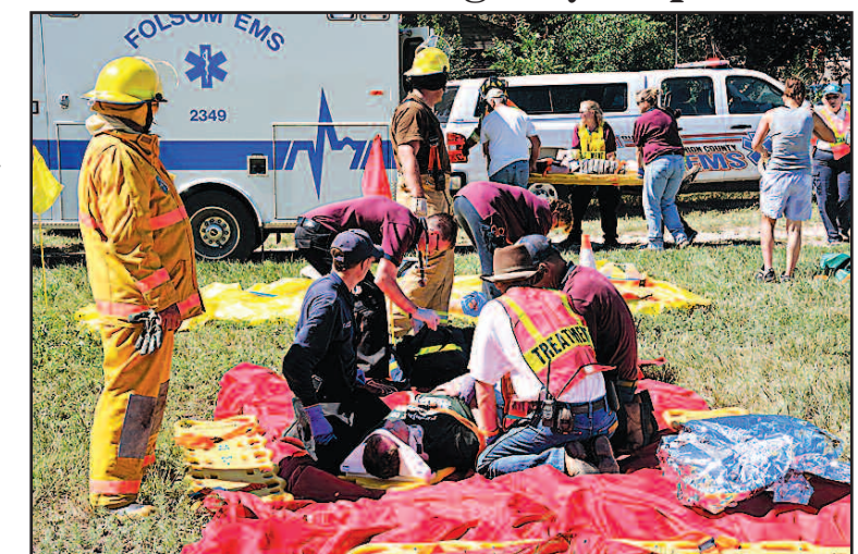
The Union County MCI Trailer brought triage materials, including color-coded tarps for treatment areas; red is the most serious area short of death - which is black.

Moines EMS building at 7:30 to be briefed on their injuries and receive moulage - the sophisticated makeup simulating those iniuries. At 9 a.m. they listened to instructions and further training from six of the event's organizers in succession, even as the emergency responders gathered to receive their instructions in the shade of the bank, where morn-