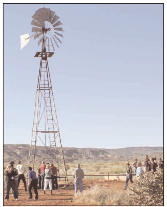
Tour members view the hand constructed tower of the windmill that pumps water for the cattle on the ranch. The ranch has one hundred such windmills on the land.

the auction house is responsible for the proper care and treatment of animals while in its care. According to Rogers, "If you take care of