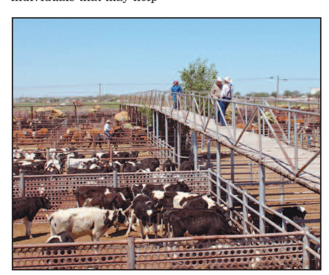
Several pens were full of cattle that were up for auction at the Clovis Livestock Auction

This year's tour followed Route 66 east from Albuquerque to Tucumcari and several points in between. The bus, filled to capacity with more than fifty passengers, stopped in