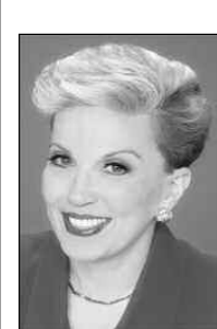
Dear Abby Jeanne Phillips

DEAR ABBY: I am writing in regard to the letter from "On the Fence in Nevada" (Sept. 11) (whose mother-in-law dumped her grand-children's cat on the side of the road). I work as an animal safety officer for the sheriff's office, and I also volunteer for a local animal nonprofit.