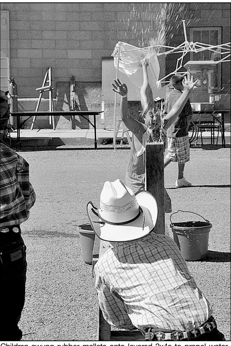
Children swung rubber mallets onto levered 2x4s to propel waterfilled rubber chickens through the air, aiming for water-filled buckets in the street.