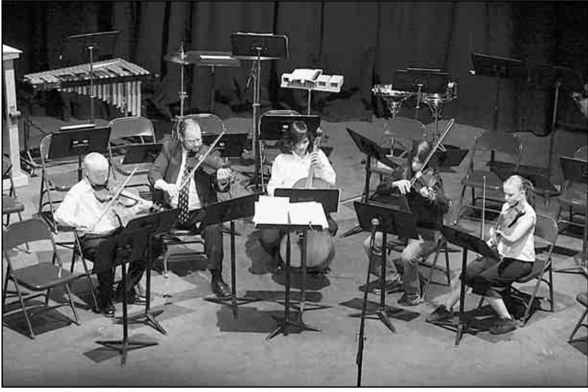
Raton Middle School Tiger Orchestra

In fact, as in life itself, the Piñon Canyon Art Project continues to demonstrate that, out of the bad, much good is born.