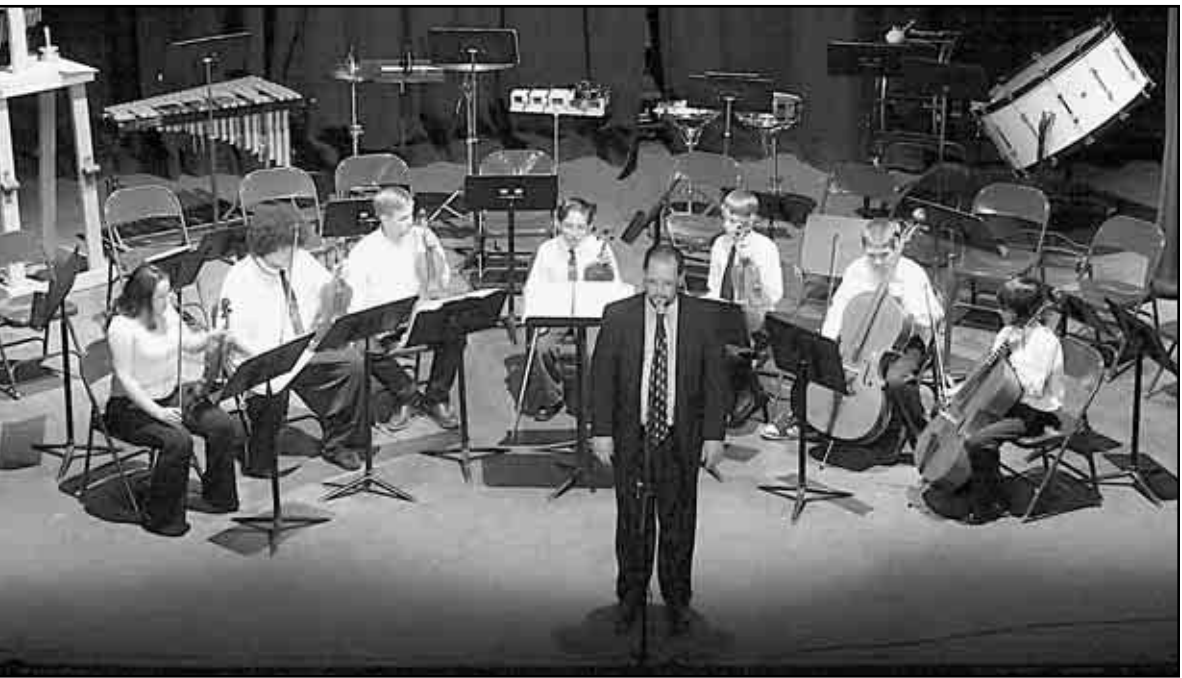
Raton Middle School Beginning Orchestra