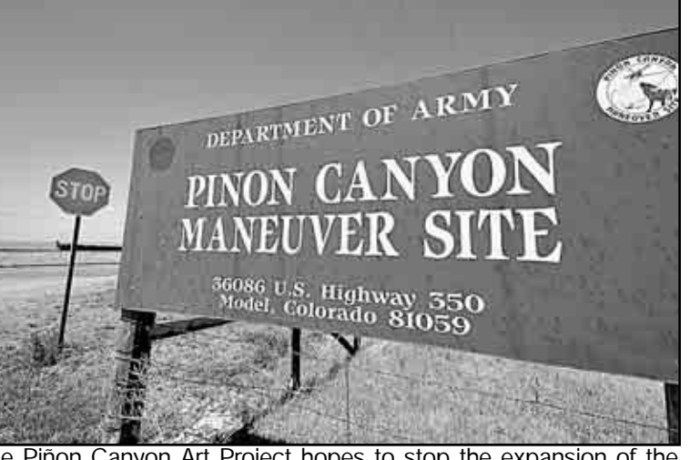
The Piñon Canyon Art Project hopes to stop the expansion of the Piñon Canyon Maneuver Site.

Purgatoire River, then October 24-25 on the Robertson Ranch at Chacuacua Canyon west of Kim. Once again, an exhibition and fundraising sale is planned for Denver in December with all proceeds again donated to the PCEOC.