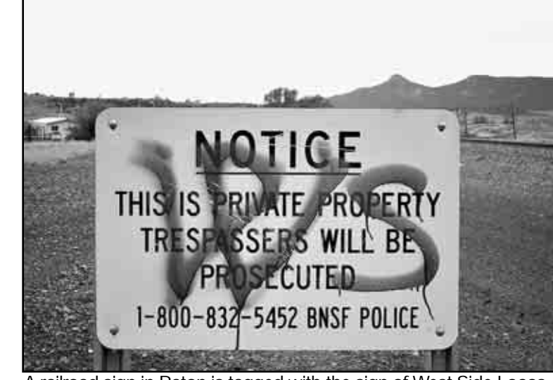
A railroad sign in Raton is tagged with the sign of West Side Locos

In addition to class levels, students are grouped for rating according to levels of experience with the Spanish language. The 'regular" category has no special experience with Spanish. The "outside experience" category is for students who do have outside advantages. The final experience level is for "native/bilingual" Spanish speakers.