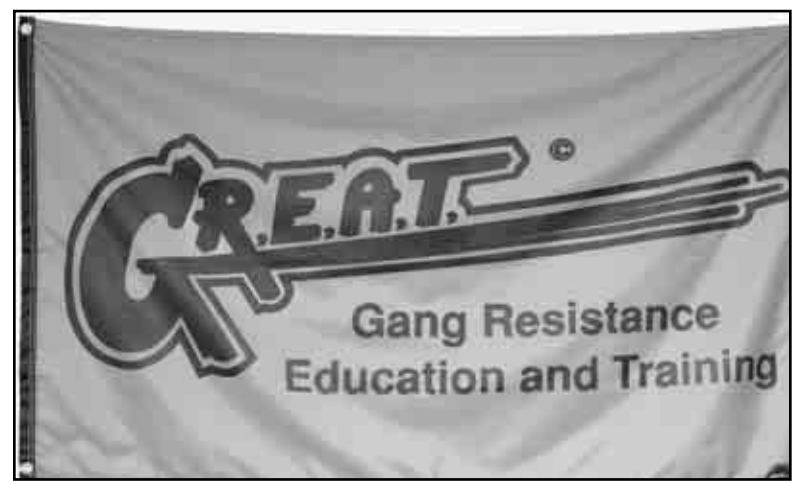
The Raton police chief's office displays this flag, left over from the days when Raton did have gang prevention - before the money ran out

suppression - he or she often school-based, law-enforcement finds the greatest effect in the prevention stage, working with students in the schools. There's been discussion within Raton Public Schools during the past year about creat-