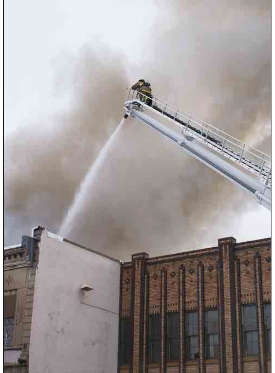
The Trinidad Fire Department used the ladder truck to combat the fire at the his- toric Frnch building