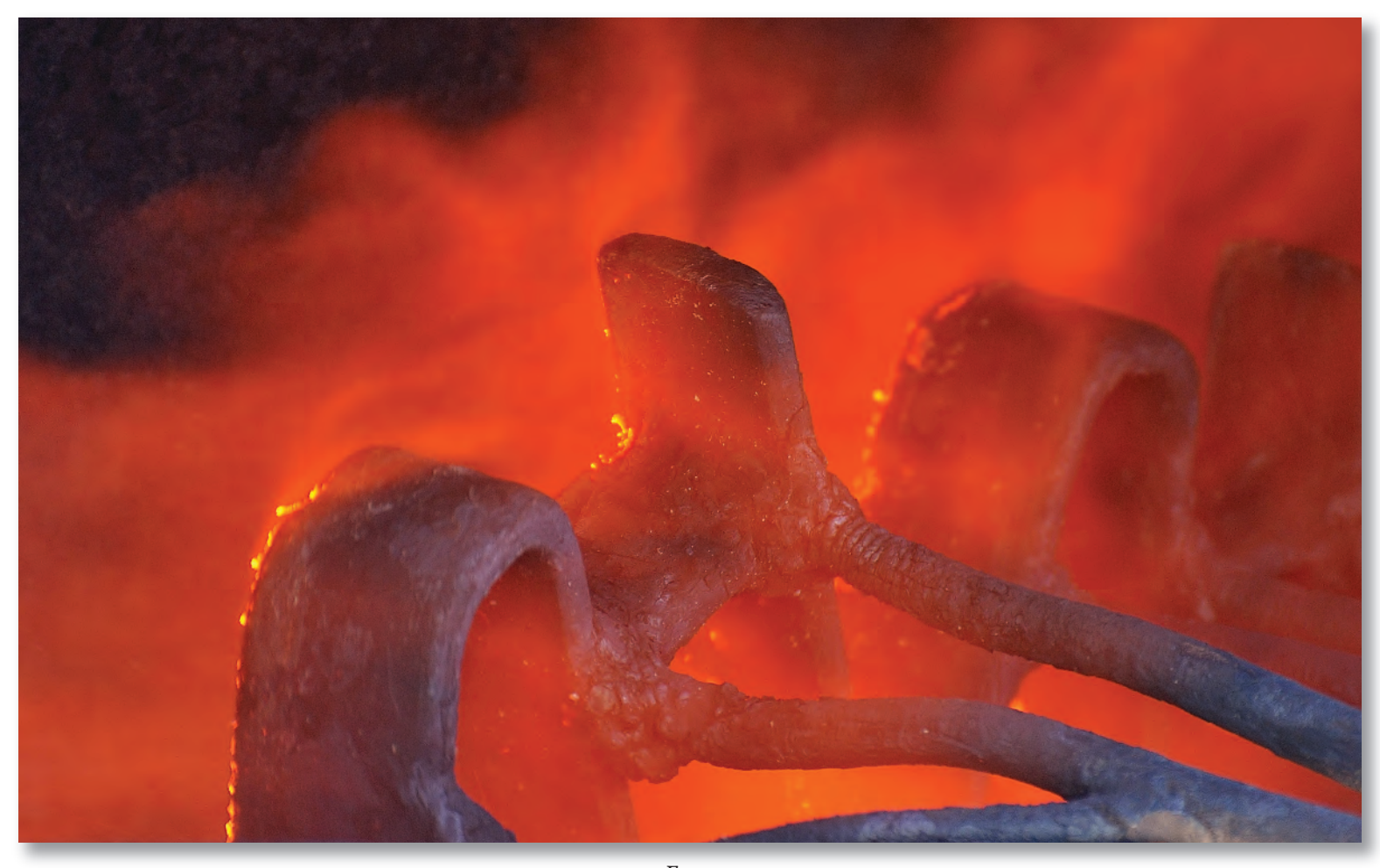
\label{Fuego} Fuego A branding iron is ready for use during the annual spring branding on the Seward Ranch in the Chico Hills of northeastern New Mexico.