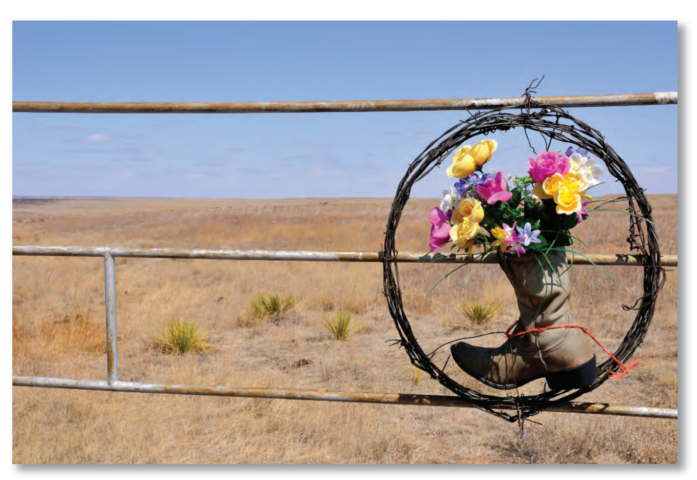
Welcome to the West.