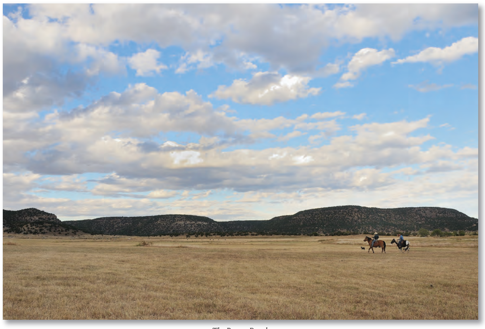
\label{eq:The Brown Ranch} The \textit{Brown Ranch} located along the Dry Cimarron River outside Folsom, New Mexico