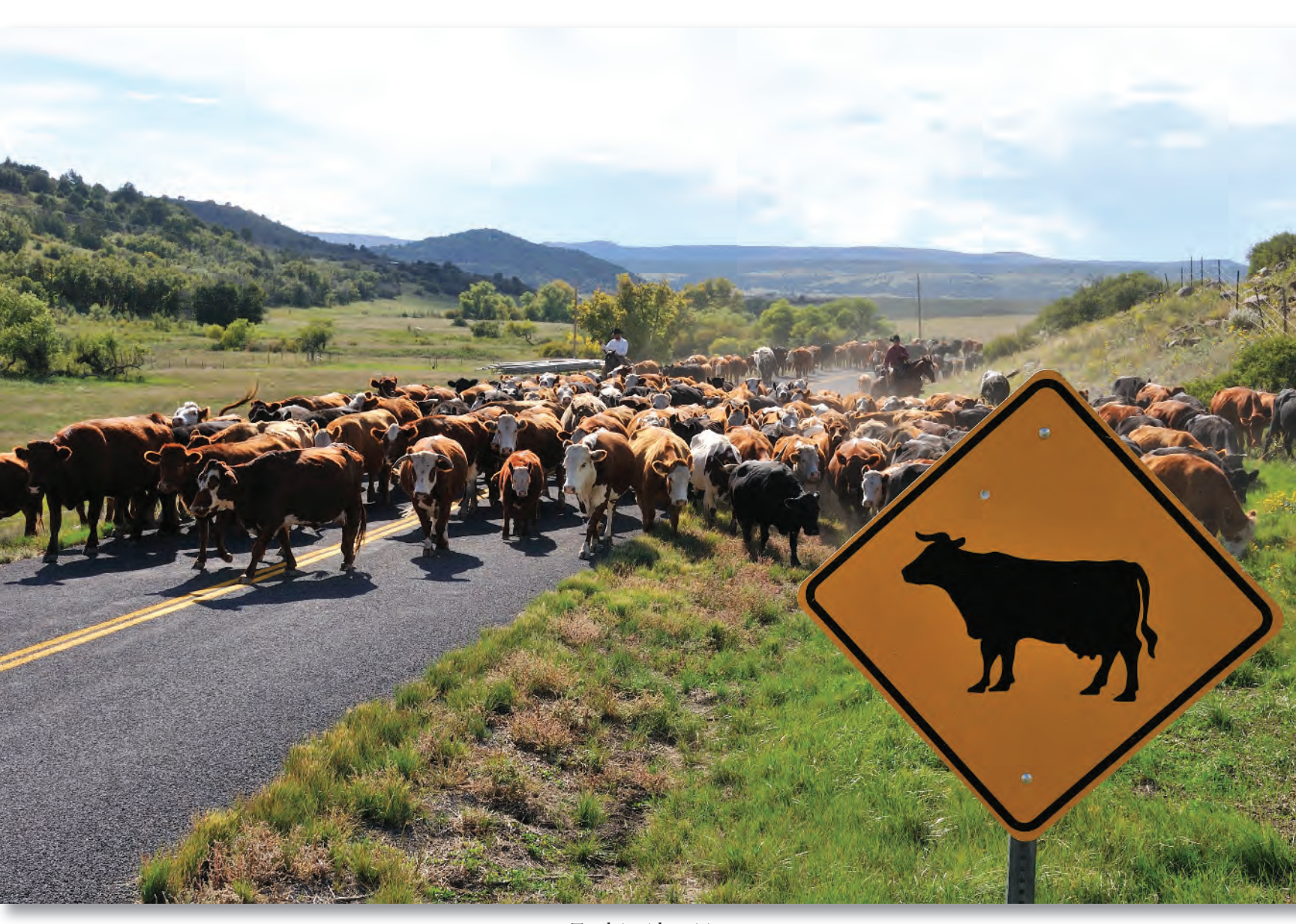
Truth in Advertising