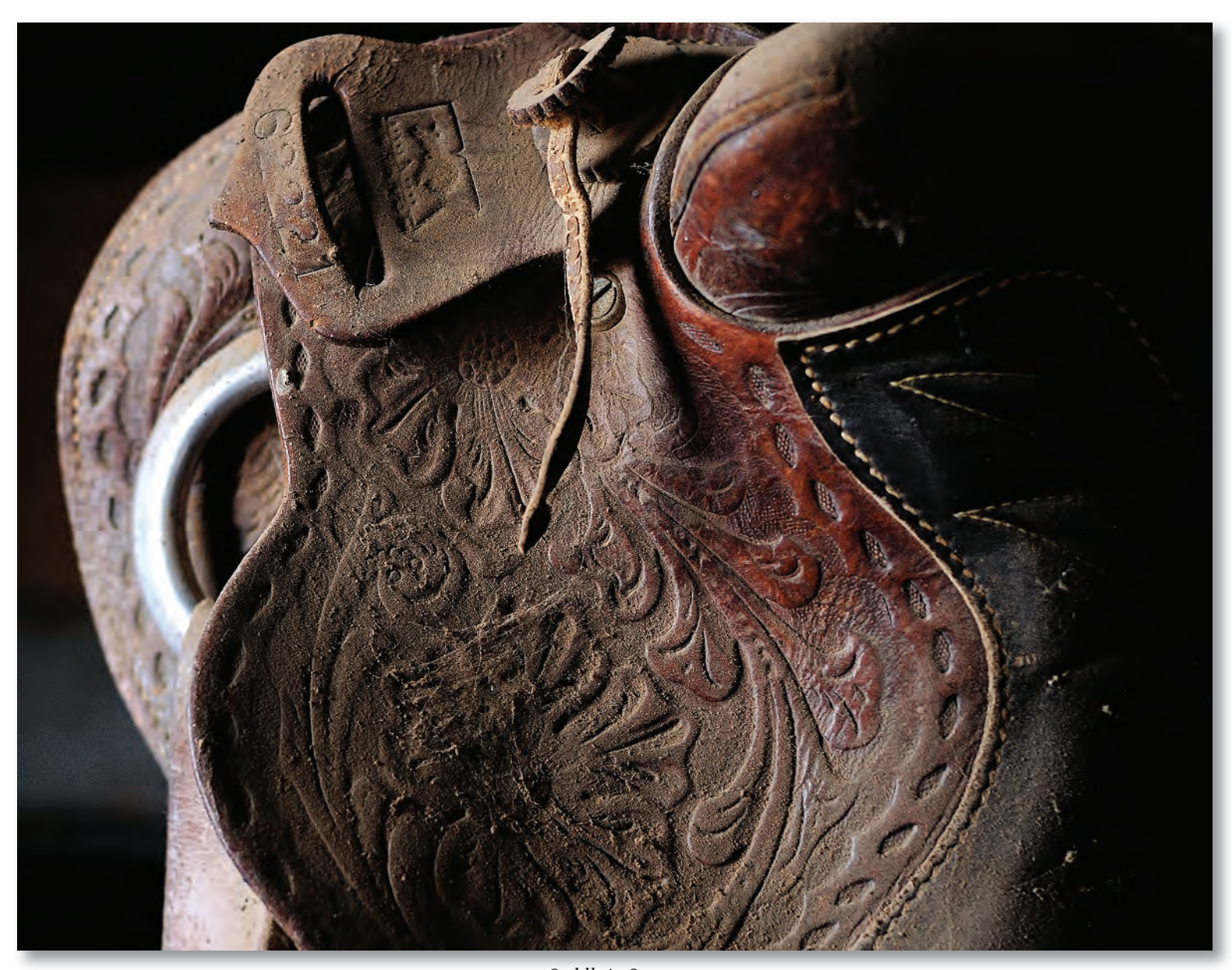
Saddle in Storage