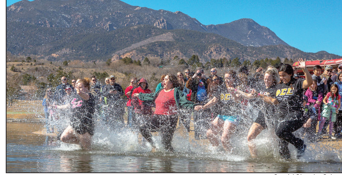
A crowd of happy plungers makes a mad dash into the icy water for a great cause during the 2019 Colorado Springs Polar Plunge. New this year, Trinidad will host its own polar plunge at Trinidad Lake State Park on Saturday, Feb. 29.

then worked through the groundwork of securing commitments from SOCO, Trinidad Ambulance and Stonewall Fire Department to make the event safe, the state