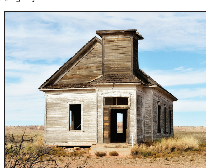
A picturesque abandoned church stands beside the highway at Taiban, two miles from where Pat Garrett captured Billy the Kid and killed one of the Kid's fellow Regulators.

I followed the Pecos north to Puerto de Luna where Billy liked to spend time. The quaint farming village was later the home