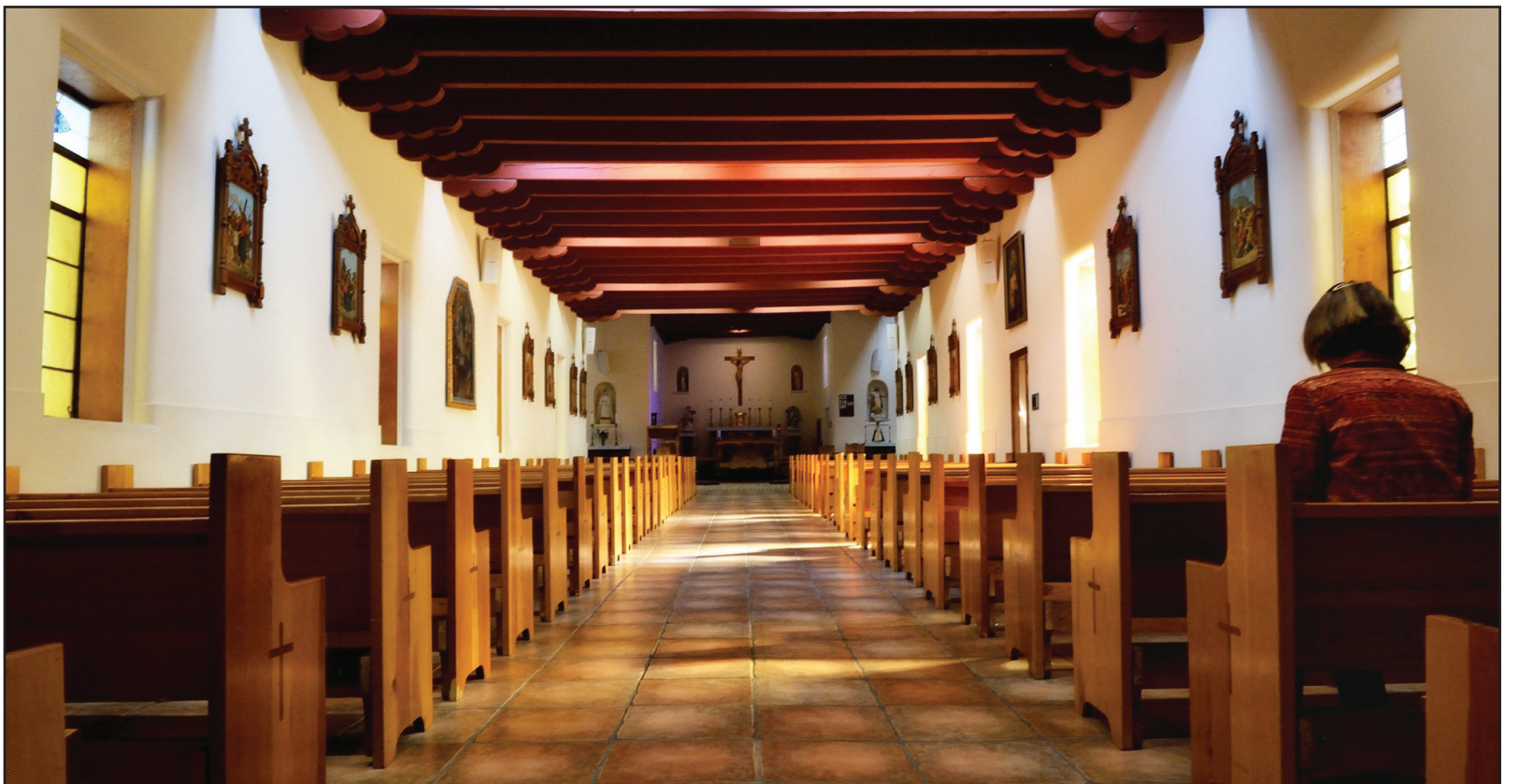
Both Billy the Kid and Pat Garrett used to gamble in the village of Tularosa, passing St. Francis de Paula Church on their way in and out of town.

After photographing White Sands—a visually arresting place better conveyed through photography than writing—we spent our road trip's fourth and final night in neighboring Alamogordo at the White Sands Motel, a lovely old motor court. Billy the Kid came back into my mind. I wondered whether there was a definitive book where I could learn his whole true story.