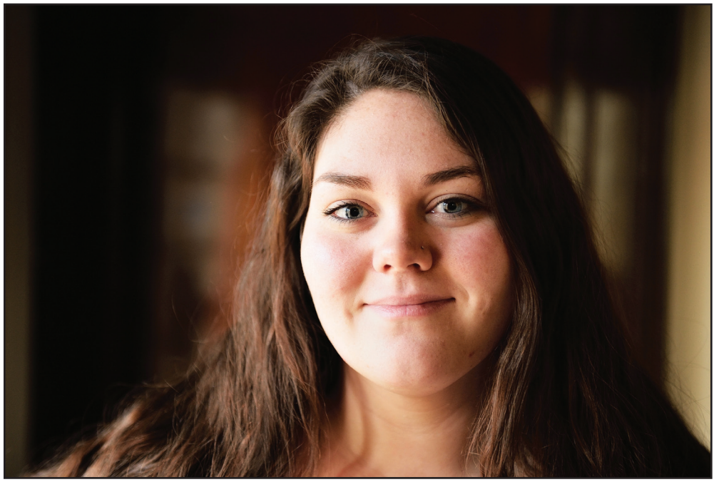
"I'm proud that I'm a nurse, the fact that I can help people. It's taken a lot of work. I'm finishing up my R.N. license and then I want to be a trauma nurse. When people appreciate my help, I feel good."