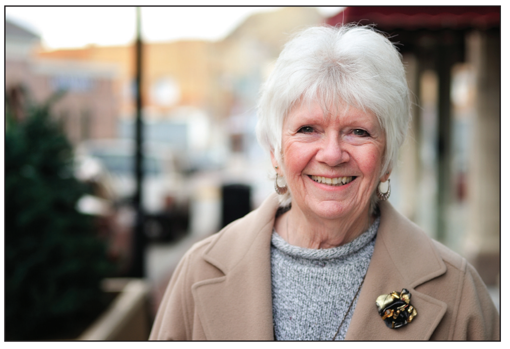
"I have a 2004 Ford Escape, midnight blue but sometimes it looks black. I bought it a year old in 2005. If you buy a year-old car, it's a lot cheaper. It's been one of the best cars I've ever had. I believe we have personal relationships with our cars.