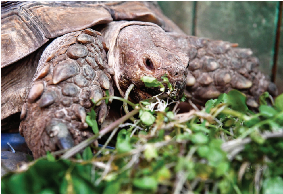
George is one of two huge turtles enjoying an easy life on the floor where visitors have to step around him at Colorado Gators. Almost 50 years old, George shares his meals with Durango, an African Sulcata Tortoise only 16 years old. Colorado Gators takes in rescued animals from throughout the U.S., with employees sometimes driving to the Denver airport to receive animals in shipping crates.