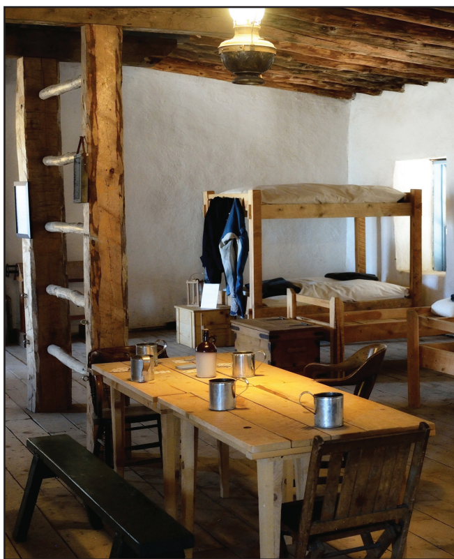
The soldiers' theater was one of several intact rooms when the Colorado Historical Society inherited Fort Garland and opened it as a museum in 1950. There were wall paintings and an area for entertainment, though the room was likely housed soldiers as well.

through October, with shorter hours in November and December. Admission fees top out at $5 for adults; they're lower