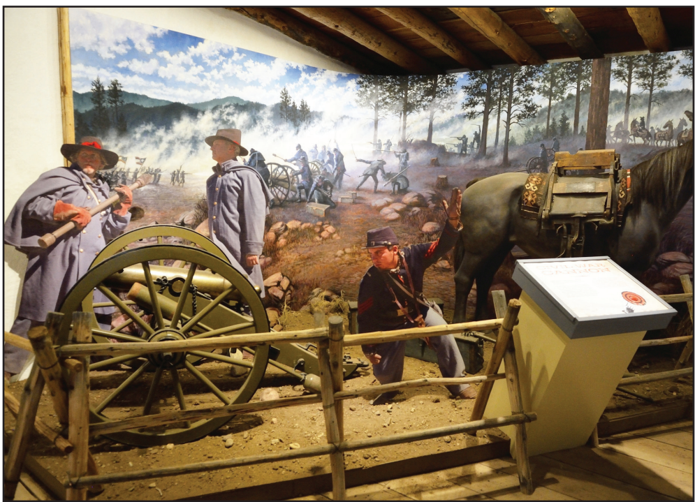
As the Civil War spread westward in 1861, two companies of Colorado Volunteers were mustered into federal service at Fort Garland and marched south to bolster forces against Texas Confederates who were attempting to capture the West. The Coloradans defeated the Texans at Glorieta Pass near Santa Fe in 1862, a pivotal battle whose story is now among many displays at Fort Garland Museum.

One book traced Colorado Scenic Byways, including Los Caminos Antiguos that passes right by the fort. Other travel guides stood near a hardbound collection of cowboy poetry