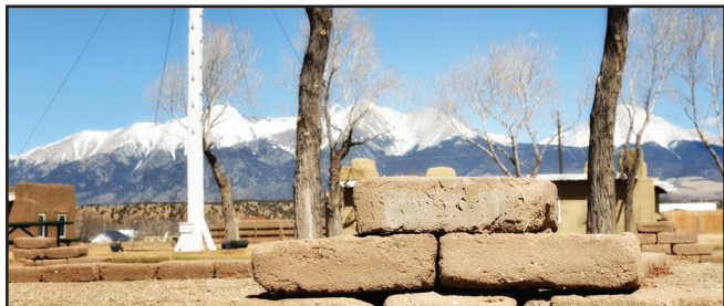
Fort Garland was built in a rectangle of adobe buildings around a parade ground, or courtyard, with cottonwood trees, a lawn, a tall flagpole and a magnificent view to the north of four of Colorado's 58 14ers, mountains over 14,000 feet in elevations. From left, Blanca Peak, Ellingwood Point, Little Bear Peak and Mt. Lindsay stood sentinel over the fort's more than 200 soldiers.