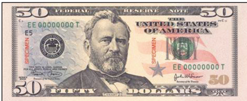
Counterfeit photo

Last year's Mud Races again thrilled spectators and it returns Saturday to the Las Animas County Fairgrounds. The event helps raise money to support the Trinidad Round-Up Rodeo.