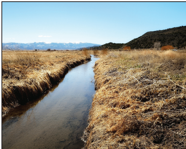
Dug by the valley's pioneer settlers, the San Luis Peoples Ditch is the oldest continuously used irrigation ditch, or acequia, in Colorado, dedicated by court decree on April 10, 1852, the year after the town's founding.

The church in Conejos burned down in 1926 and was