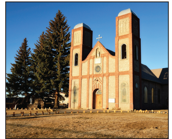
Colorado's oldest church, Our Lady of Guadalupe was established in 1858 in Conejos, just north of Antonito, dedicated by Bishop Lamy of Santa Fe. Destroyed by fire in 1926, it was rebuilt in 1927. An electrical fire three months ago has again temporarily closed the church.

Next Friday: Look for the Great Sand Dunes National Park & Preserve. Still to come: Fort Garland and Colorado Gators!