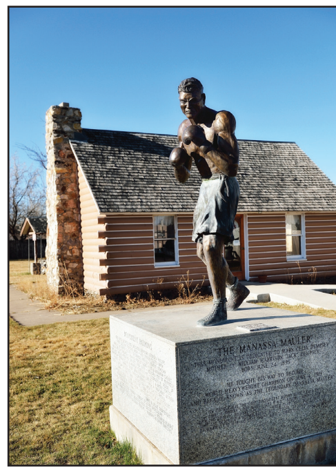
The small San Luis Valley town of Manassa, above, was the birthplace and home to Jack Dempsey who gained the nickname "Manassa Mauler" when he won boxing's heavyweight world championship in 1924. His birthplace is now a museum. Los Caminos Antiguos is a Colorado Scenic Byway, below, making a 128-mile semi-circle around the San Luis Valley. The valley is picturesque from any vantage, but Los Caminos Antiguos takes in many of valley's highlights.