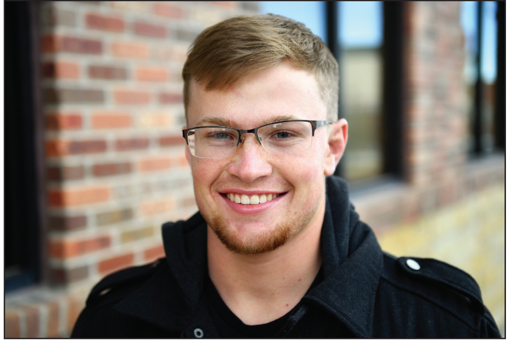
"As a country, if we're able to unite. There's a lot of division right now. On the news, it's all negative, no positive. If we're able to realize that other people have different beliefs than we do-but