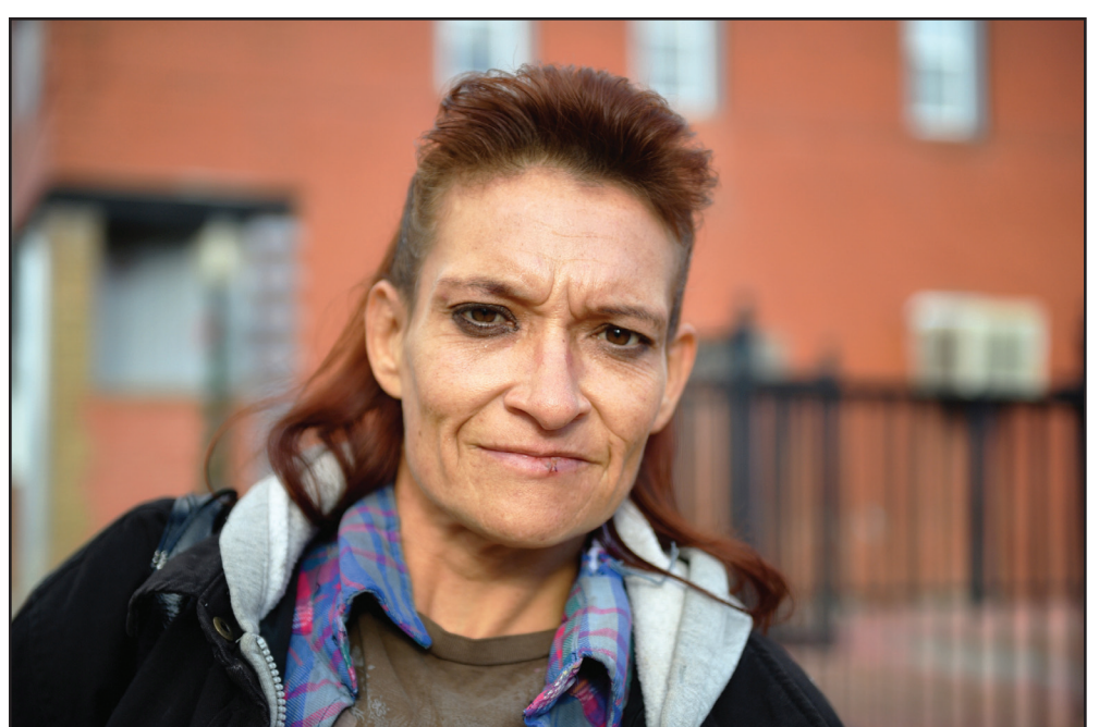
"People need to come together and make peace. People are arguing too much, especially over the election. Too much fighting. People need to come together and be at peace."