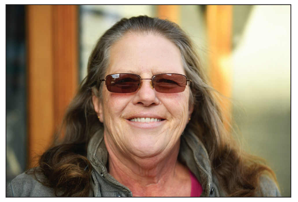
"People who don't spay or neuter their animals or otherwise don't properly care for them. Coming out of Noah's Ark, what did you expect me to say? I have two dogs, three cats and three hens. The fresh eggs are great. I share them with friends and neighbors.